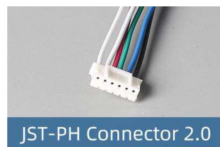
JST-PH Connector 2.0