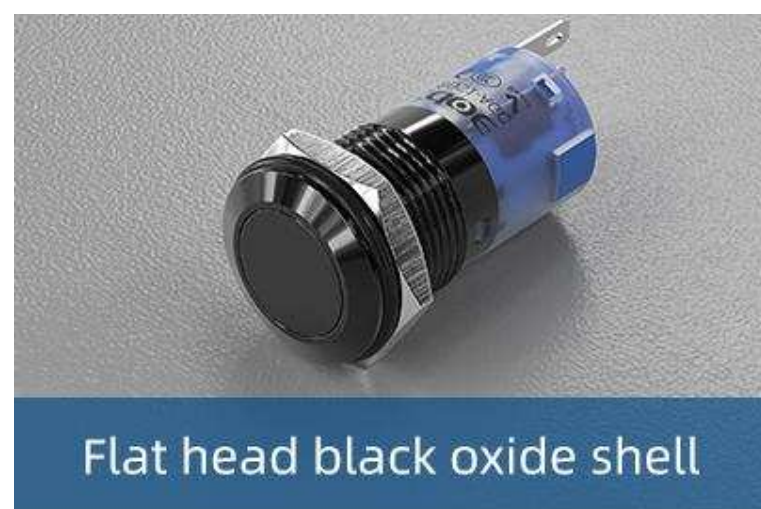
Flat head black oxide shell

They are aesthetic and ergonomic, enhancing the appearance and functionality of the device, and providing a comfortable and intuitive user experience.