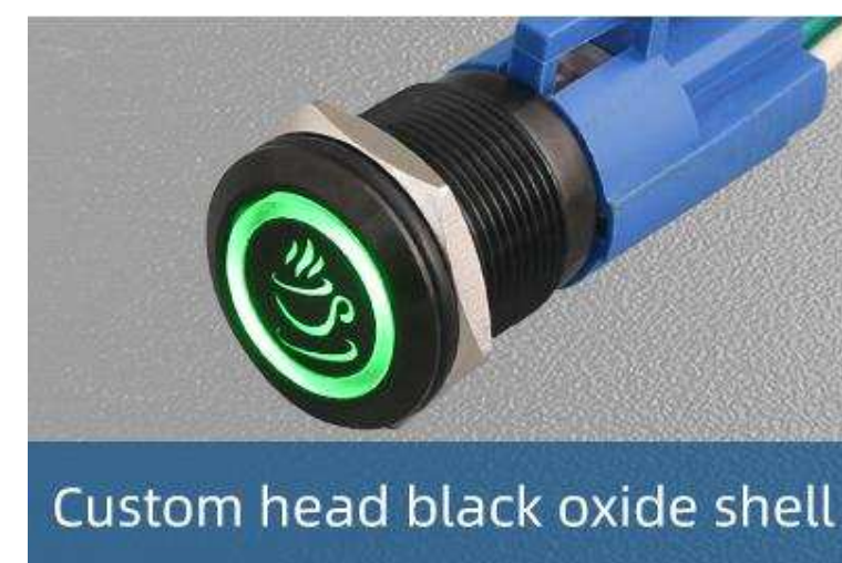
Custom head black oxide shell