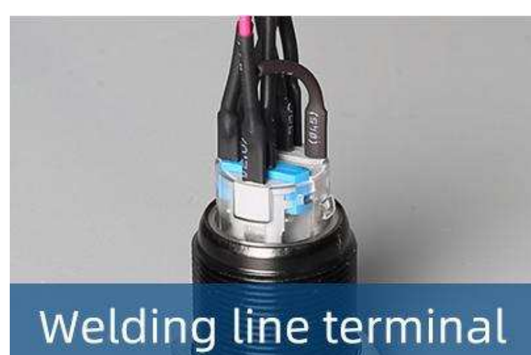
Welding line terminal