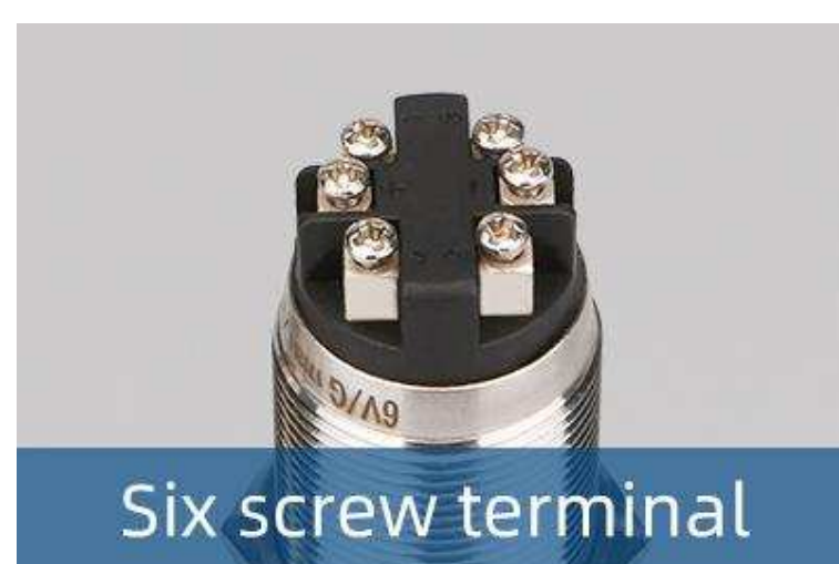
Six screw terminal