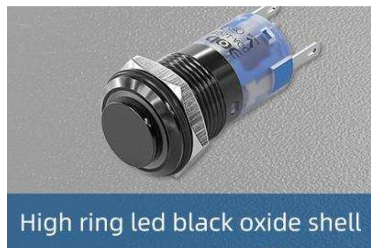
High ring led black oxide shell