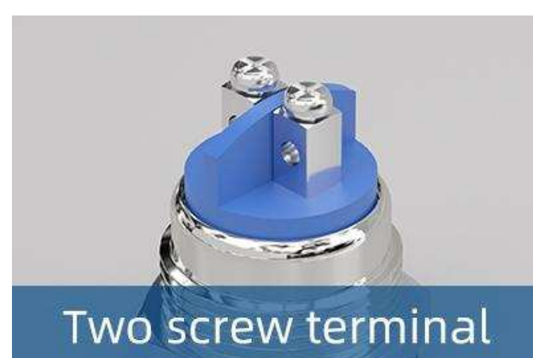
Two screw terminal