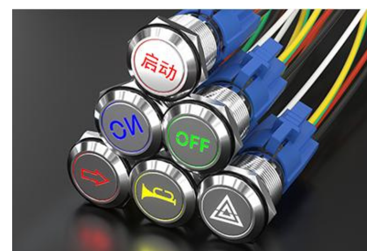
Custom laser symbol head