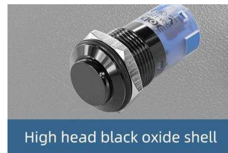
High head black oxide shell