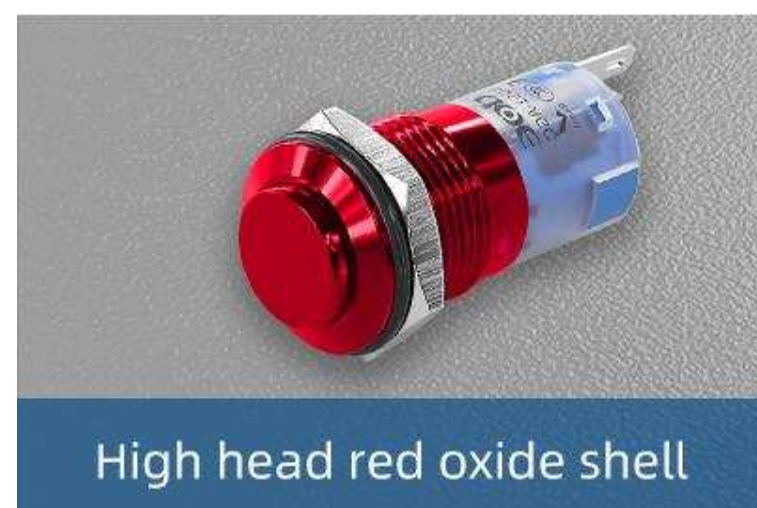
High head red oxide shell