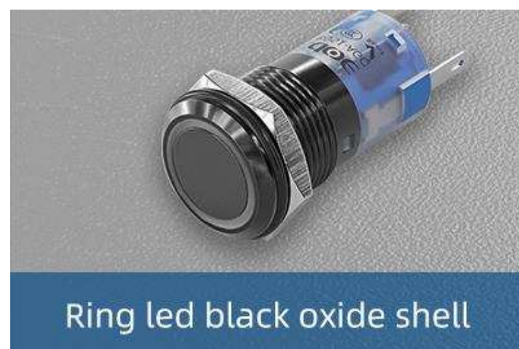
Ring led black oxide shell